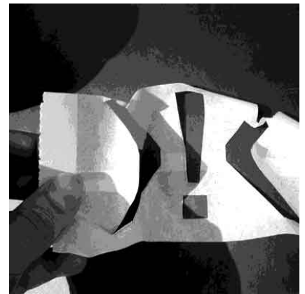
5. take off the tape from the cutting surface.