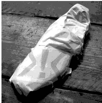
7. mask rest of shoe