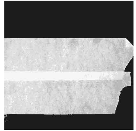
2. tape some masking tape on a glossy surface for cutting (easy to take off again).