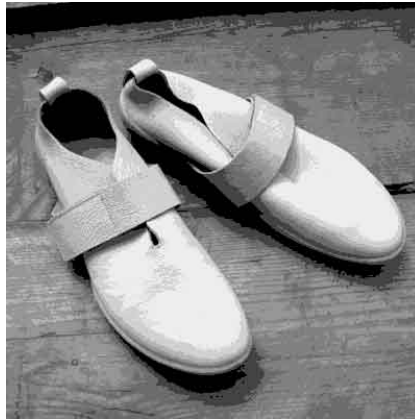
1. get a pair of fancy shoes, preferably on sale.