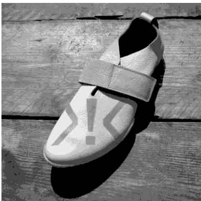
9. take off masking tape gently, save the cut-out design...