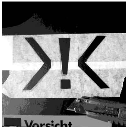
4. cut out parts to be colored.