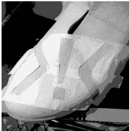
6. gently add the masked design onto the shoe. press along inner edges to make tape fit nicely (no paint flowing in under).