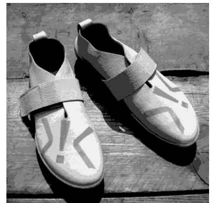
11. try walking in my shoes!