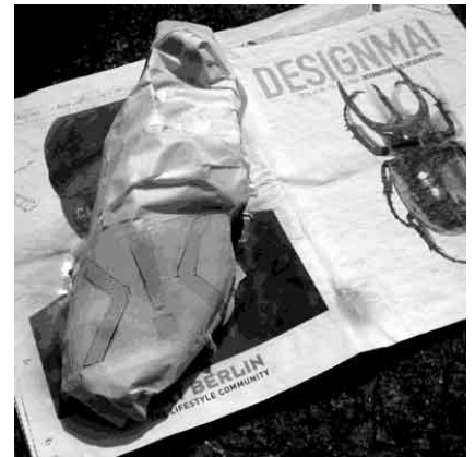
8. spray many thin layers.