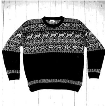
1. take your big old knitted sweater.