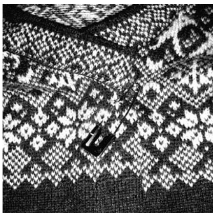
9. hold the knit wrap together with a big safety-pin.