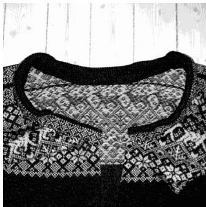
7. fold inwards the over the seam you just made and sew the edge (on top of old seam)