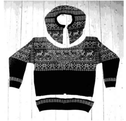
2. cut up the front. cut up a big hole at the neck and cut off the lower edge.