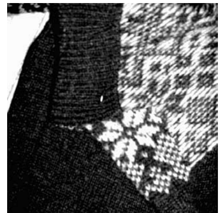
8. fold the front sides so they meet the front edges of the neck. improvise a seam.