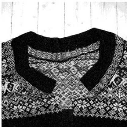
6. so it looks something like this.