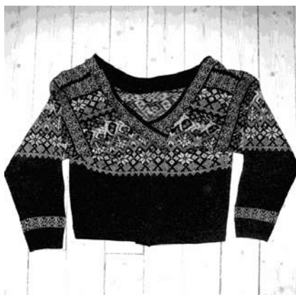
10. it could look like this. now wrap up in remade ethnic authenticity.