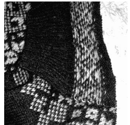
5. attach with a seam.