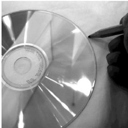
3. turn the shirt inside-out and draw the contours.