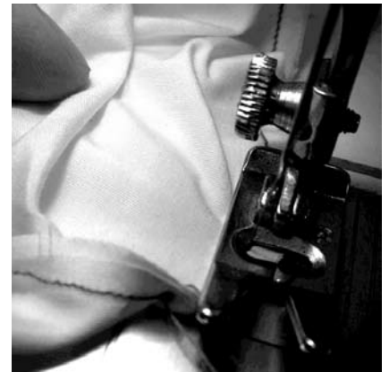
8. sew along sides.