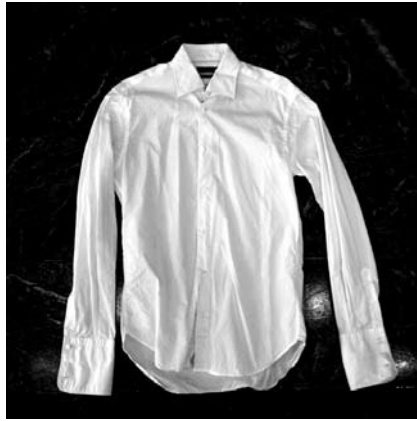
1. take an old shirt, with wide shoulders.