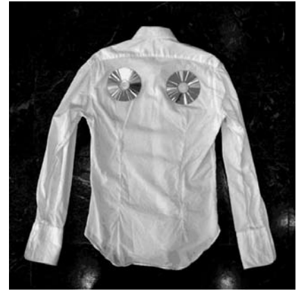
2. experiment some round (or other shape) objects as guides.