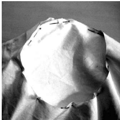
7. pin into place.