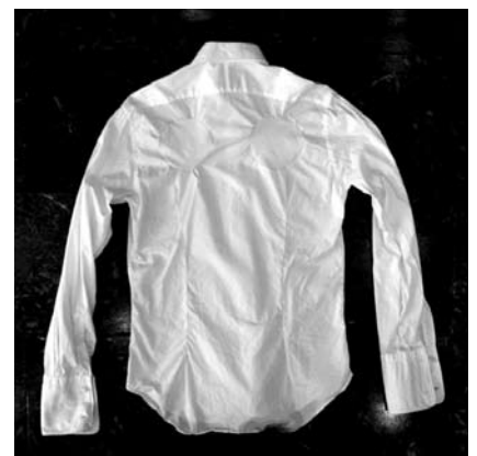
11. new texture - new fit.