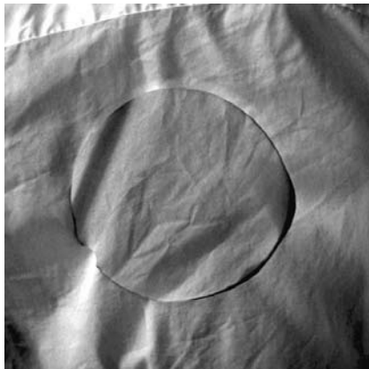
6. shift the direction 45° of the cut-out pieces (looks nice with patterned or textures shirts).