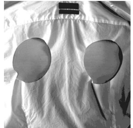
5. something like this.