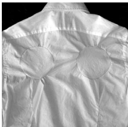
10. when turned right it could look like this.