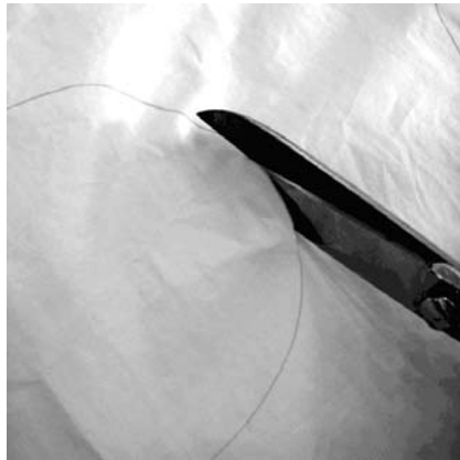
4. cut along the lines.